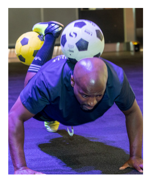
03 MAJOR EVENTS INTERNATIONAL